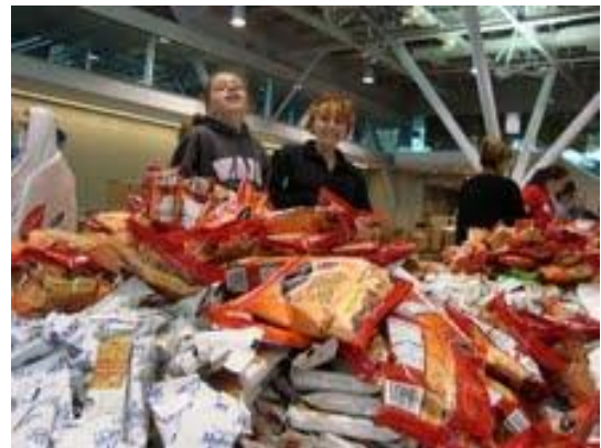
MORE CHIPS PLEASE!

May 1 st June 12 th May 15 th June 26 th May 29 th Youth group meetings are from 4-6 pm unless otherwise specified.