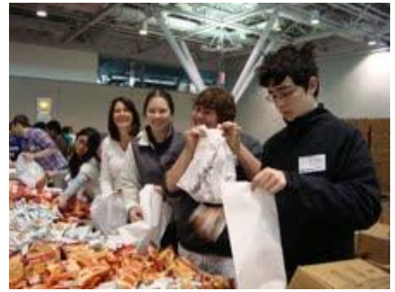
WE LOVE SNACK BAGS!