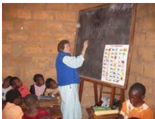
First Day with Things