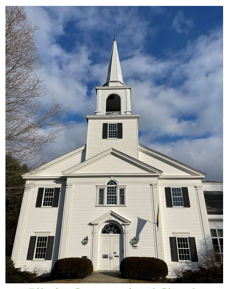
Pilgrim Congregational Church United Church of Christ Summer Worship | July 2, 2023