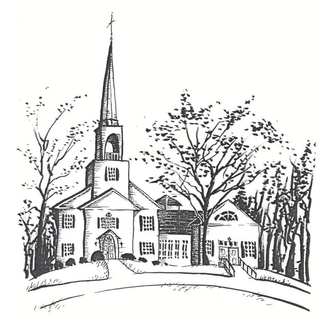
Pilgrim Congregational Church United Church of Christ February 6, 2022