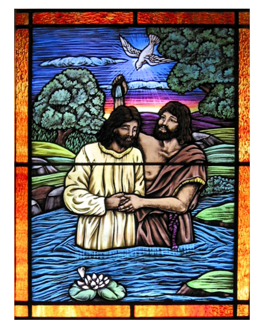
Pilgrim Congregational Church United Church of Christ January 9, 2022