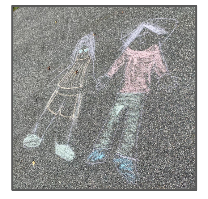
Pilgrim Congregational Church United Church of Christ October 24, 2021