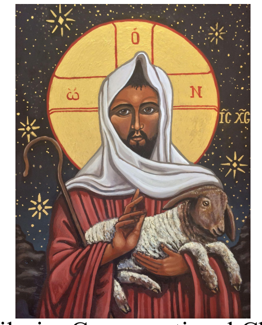
Pilgrim Congregational Church United Church of Christ April 25, 2021 The Fourth Sunday of Easter

[from: https://kellylatimoreicons.com/about-2/]