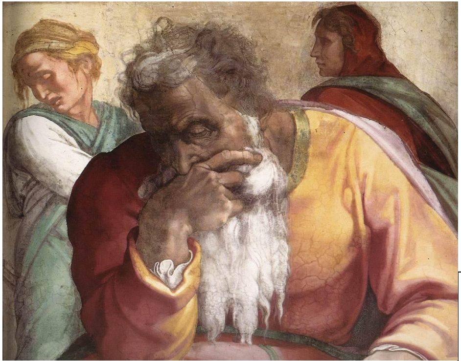
Pilgrim Congregational Church United Church of Christ Fifth Sunday of Lent March 21, 2021

Image: Michelangelo Buonarroti, 1475-1564. Jeremiah, from Art in the Christian Tradition, a project of the Vanderbilt Divinity Library, Nashville, TN. http://diglib.library.vanderbilt.edu/act-imagelink.pl?RC=55963 [retrieved March 15, 2021]. Original source: http://commons.wikimedia.org/wiki/File;Michelangelo, profeti, Jeremiah 02.jpg.