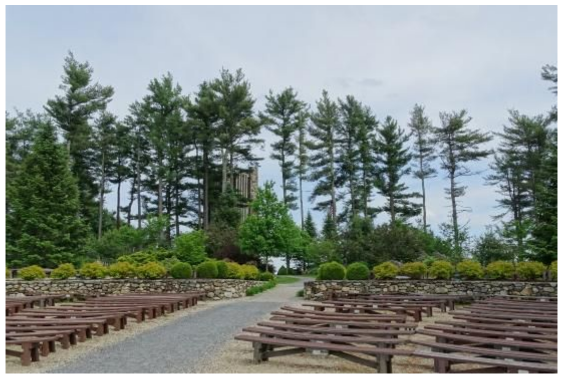
Cathedral of the Pines, NH

Opening Prayer from Still Laughing God, posted on the United Church of Christ's Worship Ways website. http://www.ucc.org/worship/worship-ways/year-a/le/eas.html