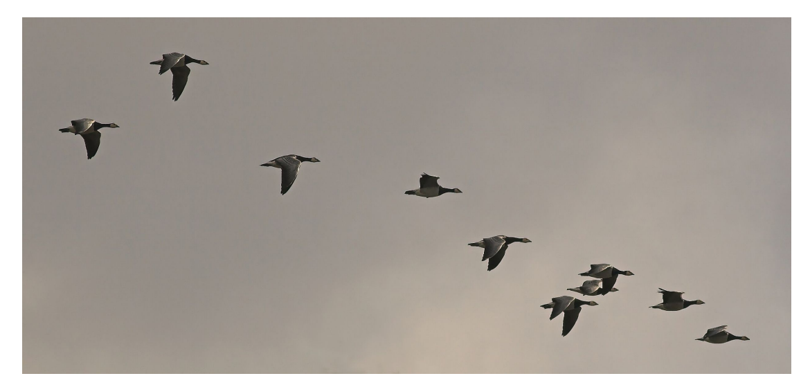
Image: By Thermos - Own work, CC BY-SA 2.5, https://commons.wikimedia.org/w/index.php?curid=1387483