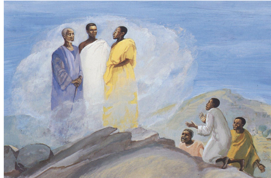
Image: JESUS MAFA. Transfiguration, from Art in the Christian Tradition , a project of the Vanderbilt Divinity Library, Nashville, TN. http://diglib.library.vanderbilt.edu/act-imagelink.pl?RC=48307 [retrieved February 8, 2021]. Original source: http://www.librairie-emmanuel.fr (contact page: https://www.librairie-emmanuel.fr/contact ).