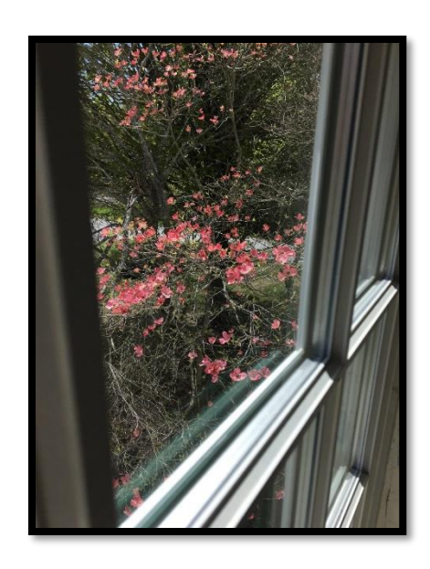
Spring arrives through the Pastor's office window