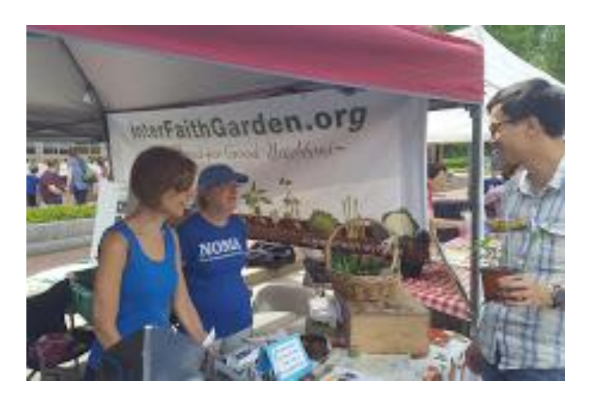
Lexington Interfaith Garden

If you went to Discovery Day on Saturday, May 25th you may have seen this tent with two Garden volunteers at Discovery Day. Many people stopped by to learn about the garden and its connection to the Lexington Food Pantry. The Garden Committee is always looking for new ways to let others know of our presence so close to the center of Lexington.