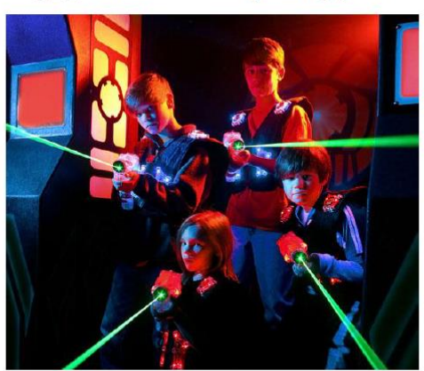
Saturday June. 14th

Cost: $15 Youth Group members $22 Non-members