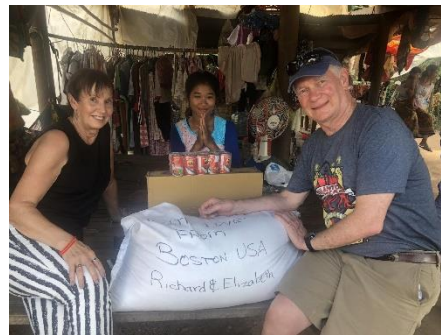
Two of several bundles of rice, protein, and water filters contributed by Pilgrim members last year.