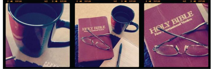
ADULT EDUCATION OFFERING FOR THE FALL 2014

Remember to bring your water back from your summer travels to church on September 14 when we will have the customary blessing of the water. We will also bless children's' backpacks and everyone's bicycles that day as well. So on September 14—bring your water, backpacks, and bikes to church to be blessed! We will be having a "Blessing of the Animals" service on Saturday, October 4. More details to come soon!